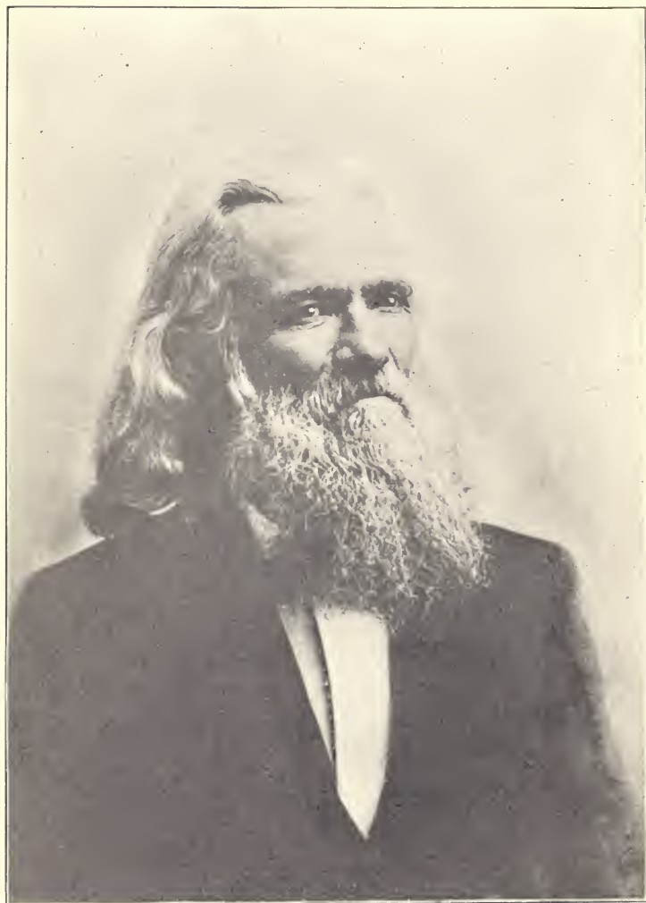
GENERAL WILLIAM R. BOGGS